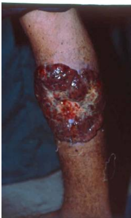
Figure 1. A vegetative sessile plaque with central depression on the medial side of the left lower leg

deep dermis, the tumor cells grew in small nests without palisading or clefting artifact. Pleomorphism and frequent mitotic figures were seen.