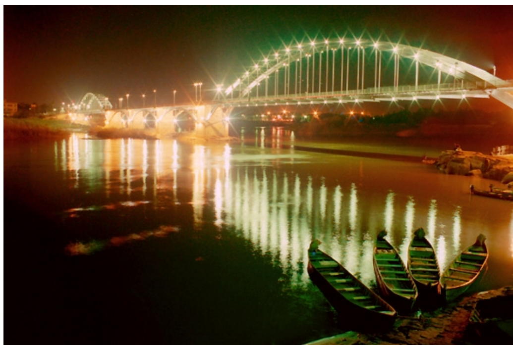
Ahwaz Bridge, Khuzestan Province, Iran